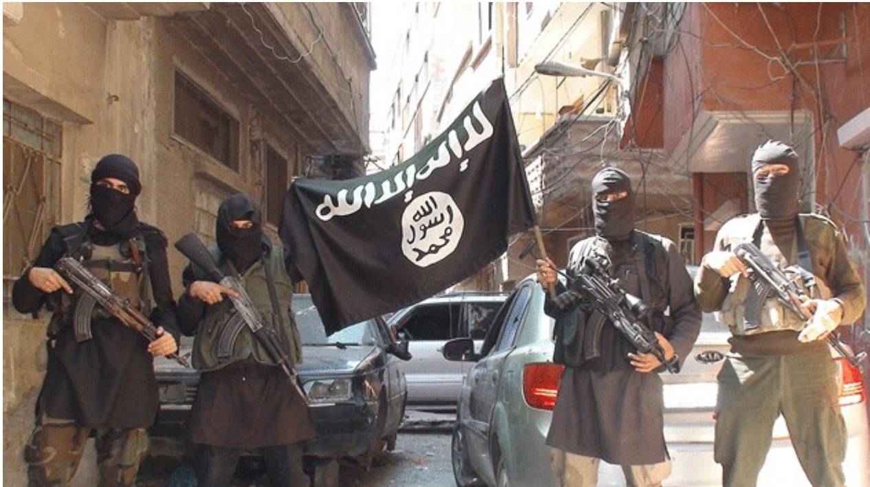
ISIS militants posing outside of Damascus, Syria, in April.

The week after ISIS launched its catastrophic November attacks in Paris, the Institute for Economics and Peace (IEP) published its annual "Global Terrorism Index." It contained an unexpected finding: By killing 6,664 people in 2014, the Nigerian Islamist extremist group Boko Haram was the world's deadliest terrorist group, beating out ISIS by nearly 600 victims. But the report, with its exact-sounding figures, raises a question: Is it really possible to know how many people ISIS has killed?